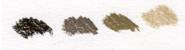
Insert Fig 8

For this Demonstration I used pastel pencils.