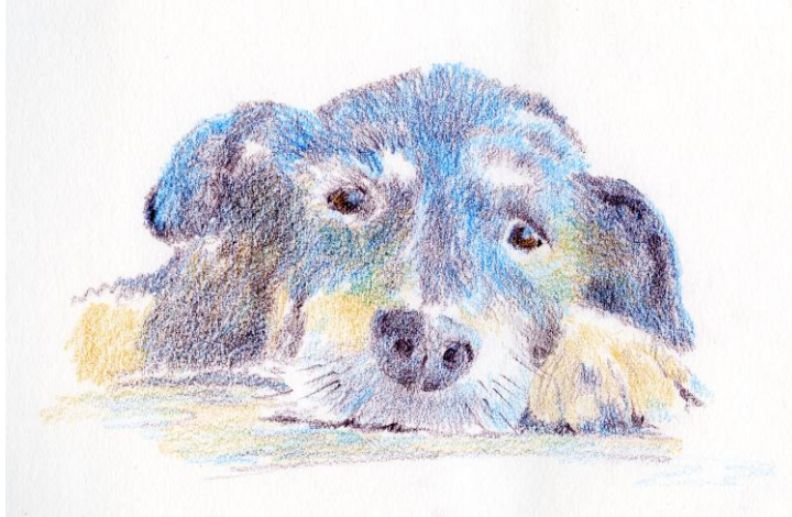
Fig 13 Waiting to play. 14 x 20 cms Colouring Pencil Drawing