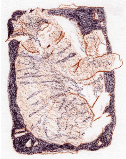
Fig 6 Tabby in Laundry basket 11 x 14 cms Colouring Pencil Drawing

Of course it may take you a little longer, but try not to labour over it. Have both pencils at the ready and just go for it! Once this is achieved the next stage can be done even if the animal moves.