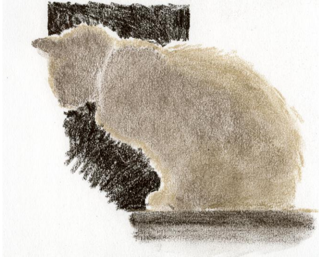
Fig 9 Step 2

Using my forefinger, and small circular movements, I smudge the entire cat. This leaves a suggestion of texture but flattens the shape. This is good, it gets rid of all that white paper, so I am now ready to block in the dark background. This will automatically suggest light on the cat! How easy it that! Use whatever is there to create the background, avoid 'making it up' which rarely looks convincing and often looks like an after thought. Notice how quickly and loosely I add the dark. I don't have time to spend time colouring it in nicely, my subject may wake up!