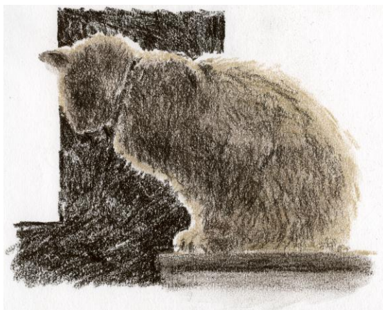
Fig 10 Pastel 'Smudge' 19 x 25 cms Pastel Drawing Step 3

Using my forefinger, and small circular movements, I smudge the entire cat. This leaves a suggestion of texture but flattens the shape. This is good, it gets rid of all that white paper, so I am now ready to block in the dark background. This will automatically suggest light on the cat! How easy it that! Use whatever is there to create the background, avoid 'making it up' which rarely looks convincing and often looks like an after thought. Notice how quickly and loosely I add the dark. I don't have time to spend time colouring it in nicely, my subject may wake up!