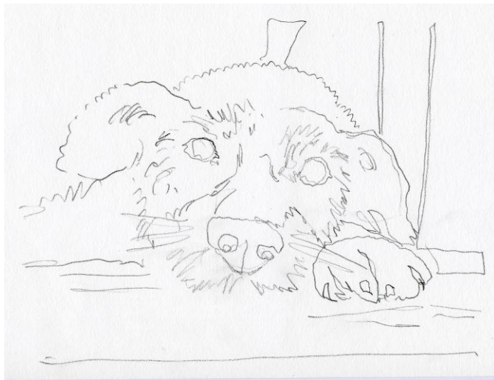
Fig 3 Preliminary drawing 19 x 24 cms

This technique is not technically sketching. The line is constant and the result is a confident yet quirky drawing. Often this type of drawing can say much more than a sketch and take very little time to complete, ideal for drawing animals.