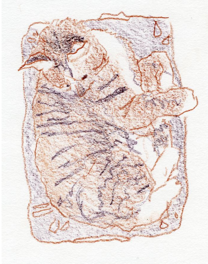
Fig 4 Step 1