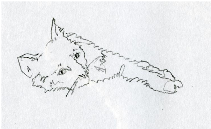
Fig 1 Resting 'Smudge' 6 x 12 cms

Firstly, it is vital that you choose a time when your pet is resting, or calm. Perhaps curled up in a favourite chair, in front of the fire, on a windowsill or asleep in its basket. This will ensure that you have plenty of time to observe without it moving as well as you both being still and quiet. This is the perfect start.