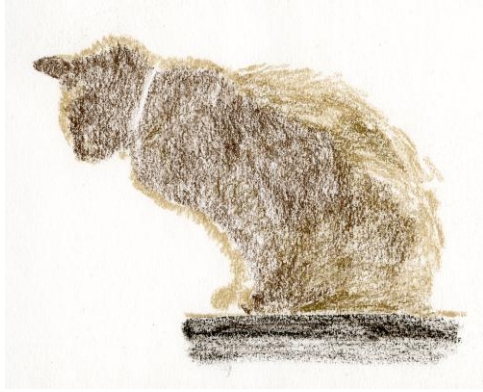
Fig 7 Step 1

For this Demonstration I used pastel pencils.