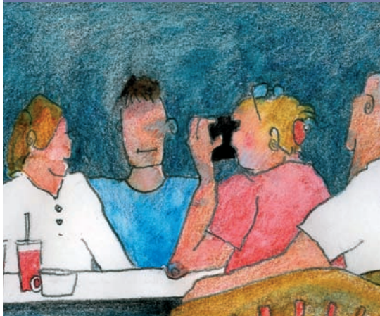
Holiday Photos (Finished drawing 4 1/2" x 6")